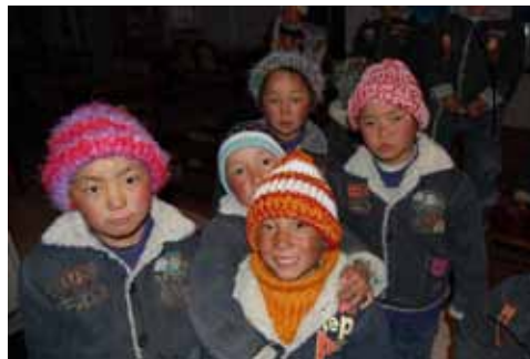
The team will be visiting children and handing out hats to them.

Several years ago, Shining City Foundation was established by members of Gloria Dei to help the impoverished in the mountainous areas of China. Since its inception, they have been involved with building church/community centers in remote areas to help host and house the hundreds of worshippers who often visit. Men, women and children risk their lives to travel over rocky terrain, raging rivers and inclement weather to worship. A building will not only provide a safe place to worship, but will also be a place for travelers to spend the night before returning home across the rugged terrain. Plans are underway for a third church.