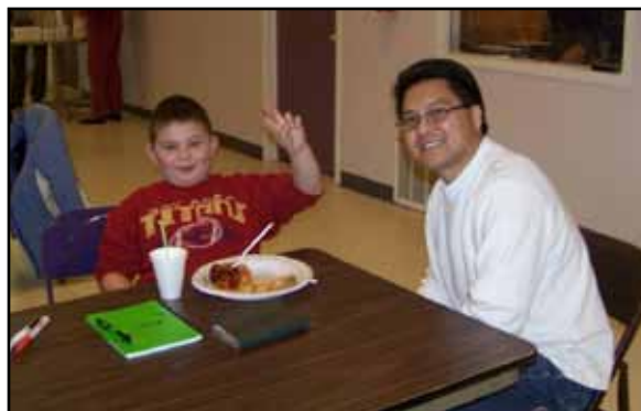
Teens and children from Freedom for Youth are involved in work, study and fellowship.

Beginning this fall, Gloria Dei will begin its third year of serving dinners to the youngest children and their tutors the first Monday of each month. Dinners are served at 5:30 p.m.